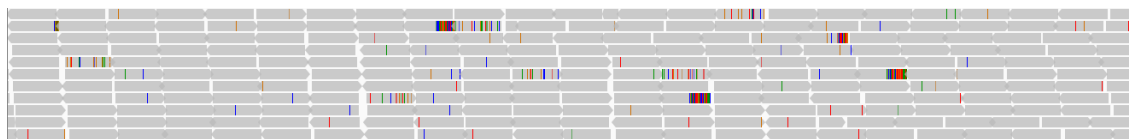
Figure 3: Simulated reads mapped in proper pair. Mismatches and soft-clips are shown as colored vertical lines in reads.