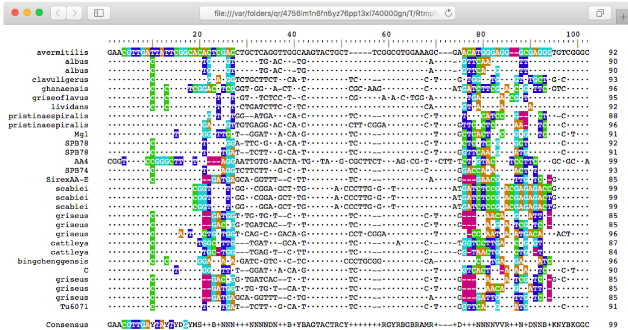
Figure 2: Amplicon with the target site for each primer colored

> # move the target group to the top > w <- which(names(amplicon)=="avermitilis") > amplicon <- c(amplicon[w], amplicon[-w])