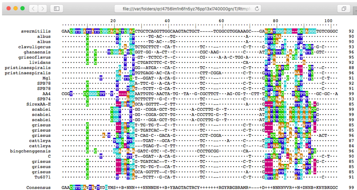
Figure 2: Amplicon with the target site for each primer colored

> # move the target group to the top > w <- which(names(amplicon)=="avermitilis") > amplicon <- c(amplicon[w], amplicon[-w])